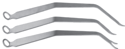
Single & Double Prong Double Bent Hohmann Acetabular Retractor - Long