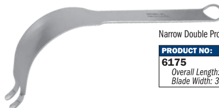
Narrow Double Prong Acetabular Retractor