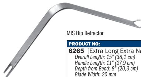
MIS Hip Retractor