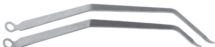
Single Prong Double Bent Hohmann Acetabular Retractor - Extra Long