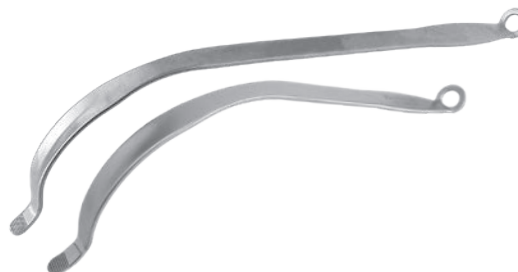
Narrow Cobra Retractors