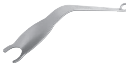
Narrow Proximal Femoral Elevator