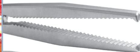
Tapered Jaw #1813